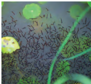
Mosquito larvae in a pond

Mosquitoes are part of the aquatic ecosystem, providing food for fish and other aquatic creatures. For humans, however, it's a different story. In addition to their annoying buzzing and itchy bites, mosquitoes carry diseases that can be serious, even fatal, to humans, like West Nile virus. Getting rid of mosquitoes and making sure they aren't breeding around your home will help keep everyone safer—and keep you and your family from getting bitten.