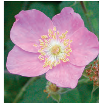
Rose varieties with fewer petals, like the native Rosa californica , grow better in cool summer areas.