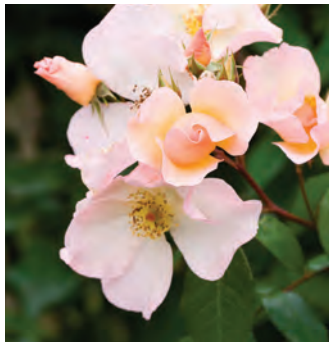
Sally Holmes is a disease-resistant, low-maintenance climbing rose that blooms throughout the season.

If disease or pest problems can't be managed by good garden housekeeping, you may want to use a less-toxic pesticide. Because these products prevent but do not cure disease, treatments must begin before symptoms are widespread. To avoid burning leaves and flowers with chemical spray, water plants the day before you treat them and test a few leaves and petals before spraying the whole plant. Be sure to coat both sides of the leaves.