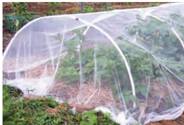
Row covers keep snails out.