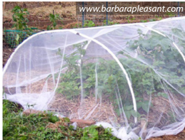
Row covers keep snails out.